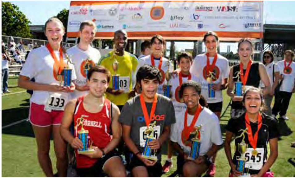
The winners of the 8th Annual Run for Your Life 5K

The Recovery Month observance aligns with Odyssey House’s mission to provide comprehensive and innovative services to New Yorkers struggling with substance use and/or mental health disorders and to provide them with high quality, holistic treatment. Our annual Run for Your Life 5K Run & Recovery Walk, this year held on September 28 th , is the premier NYC recovery month event, attracting individuals in treatment, their families and friends, supporters of recovery services and all the major NYC treatment programs. In addition, the Odyssey House Recovery Oriented Care Service (ROCS) program is very active in these celebrations, hosting special events for our clients and their families and attending the national recovery rally in Rhode Island and the New York State rally in Albany. ●