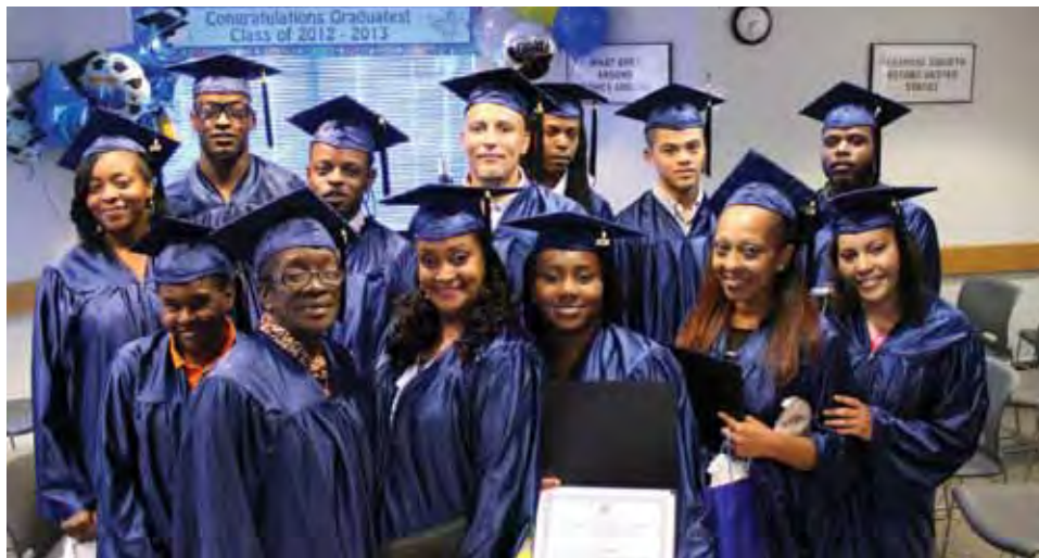
The Class of 2013 proudly show off their certificates at the 13th Annual GED Graduation Ceremony.

Passing the General Educational Development (GED) test enables Odyssey House residents of any age to reach a higher platform of educational achievement and gain numerous