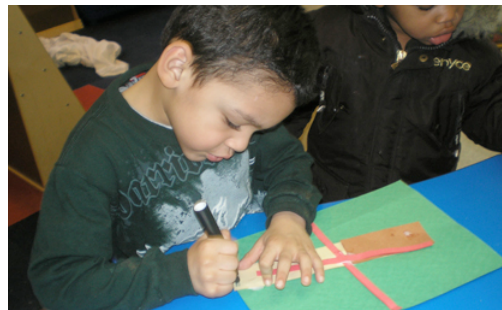
Family Center preschooler works on a project inspired by Kim Gasselin's book, Smoking Stinks .

Children enrolled in universal prekindergarten at Odyssey House took part in a project aimed at preventing them from smoking at a later age. Smoking prevention at such a young age may seem unusual, but there is