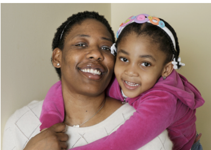
Family partners. Mothers with young children form strong bonds living together at the Odyssey House Family Center of Excellence.

Partnerships is a key goal of Odyssey House adolescent treatment services.