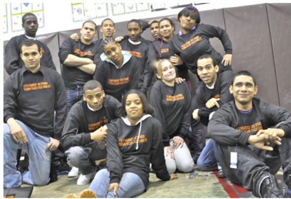
Fifteen teens in residential treatment are participating in the Odyssey House Theatre Project.

Fifteen adolescents in residential treatment are participating in a three-month playwriting workshop — the Odyssey House Theatre Project. The teens are learning about all stages of the playwriting process, from concept development to stage production.