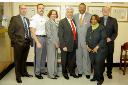
Department of Correctional Services Commissioner Brian Fischer joins representatives of criminal justice and treatment agencies at the new Odyssey House Edgemcombe Residential Treatment Facility.