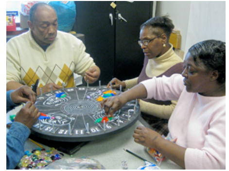
ElderCare clients hard at work on their project, Queen Fortuna's Wheel; each number corresponds to a prediction deconstructed from fortune cookie texts.

The show will open to the public in October at the Haven Art Gallery, 239 E.